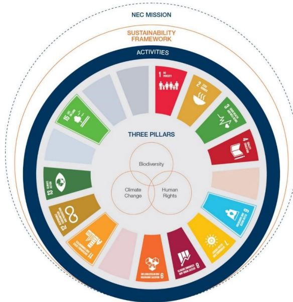
Figure 1 - NEC's Sustainability Framework

Under NEC's ESG Policies, environmental, social and governance ("ESG") factors are considered throughout the investment process, from specifying a category of excluded activities during the project selection phase ("No-Go" activities), to initial screening and full due-diligence on funds, assets, sites and counterparties during the pre-acquisition phase. ESG clauses are included into the financing documentation and key contracts with NEC's counterparties, including the share purchase agreement (SPA), agreements with the engineering, procurement and construction contractors ("EPC Contractors"), the operation and maintenance contractors ("O&M Contractors") and the master service agreement with the asset manager. Where applicable, an ESG action plan ("Action Plan") is adopted. The Action Plan is agreed during the negotiation phase and enables any gaps to be filled that may exist between the standards NEC seeks to uphold and those of the project and its various counterparties. Finally, during the ownership phase NEC will ensure that any mitigation measures identified in any Action Plan are implemented and reported on by the asset manager.