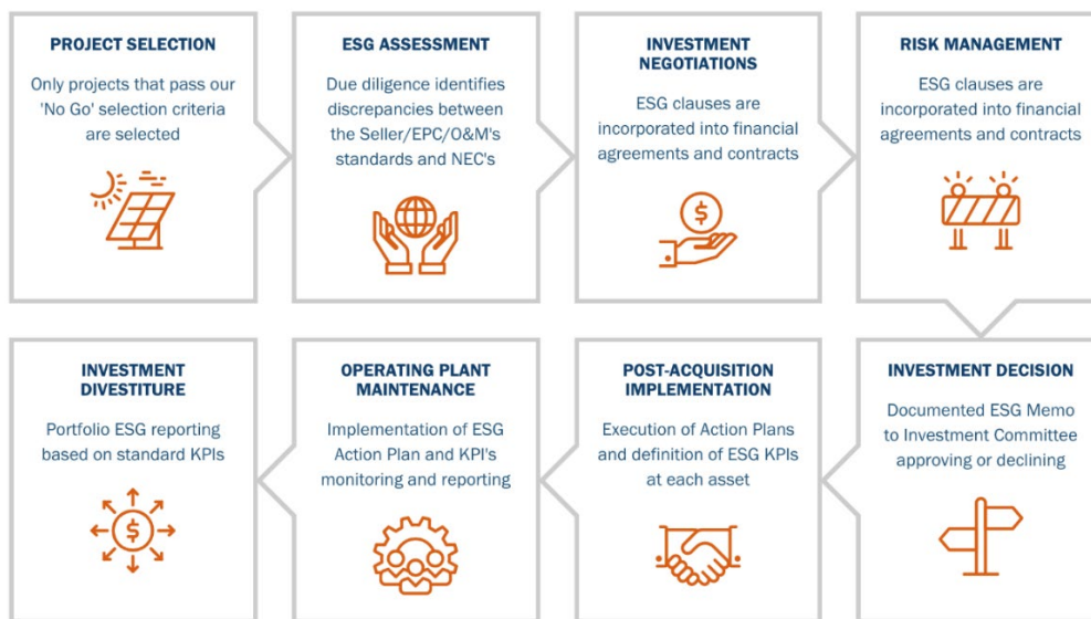
Figure 2 - NEC's Sustainability Framework

The exact due-diligence scope for any given investment is determined by country and region-specific considerations, the potential risks associated with the specific counterparty and project, and by the risks inherent to the sector. At a general level, NEC’s consideration of PAIs is integrated throughout NEC’s investment process: from an ESG screening during the initial project selection, to a subsequent ESG due-diligence and assessment during the pre-acquisition phase, providing input and making recommendations for the investment decision, carrying out ESG monitoring and reporting during the ownership phase and, finally, divestment. ESG clauses are also included in key contracts with our counterparties, including EPC and O&M Contractors.